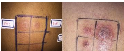
Fig. 3. Strong positive reaction to fragrance mix 1 and balsam of Peru, and extreme positive reaction to PPD

Among patch test positive results from both allergens and patient own products, most patients were strong positive reaction with their patch test allergens (46.9%), followed by weak reaction (28.1%), doubtful reaction (15.6%), extreme positive reaction (4.7%) and IR irritant reaction (4.7%).